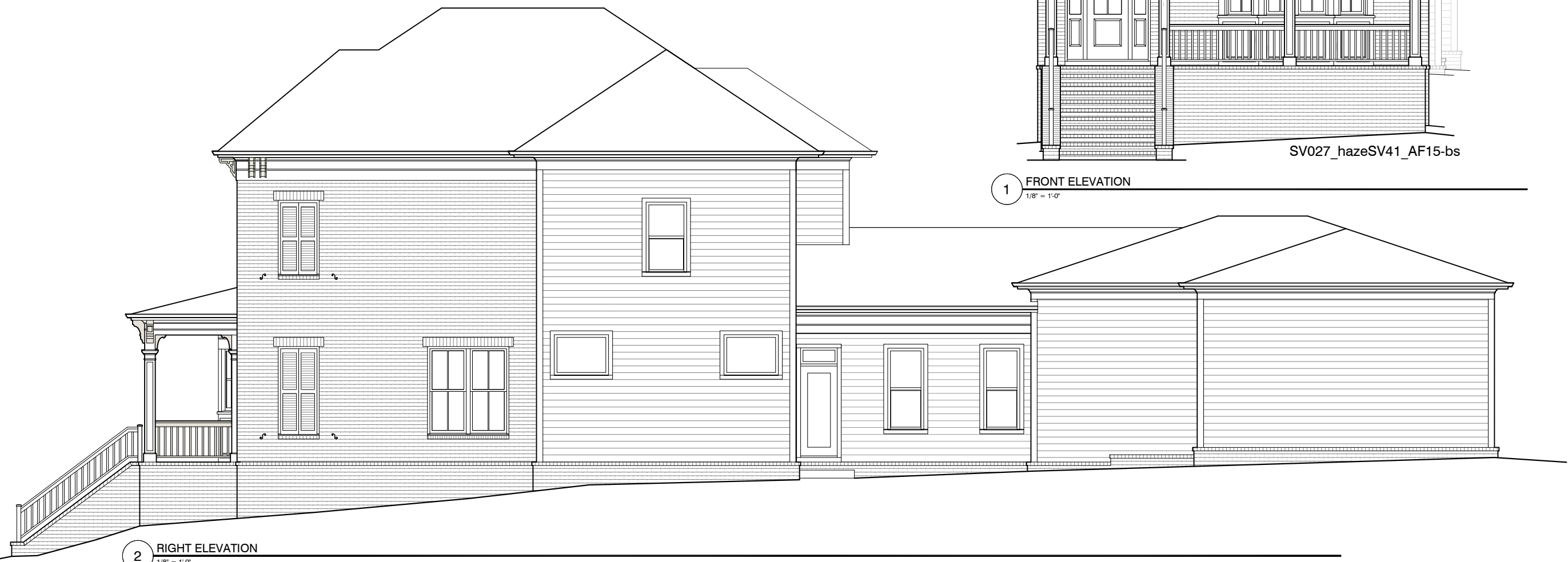
2 RIGHT ELEVATION 1/8" = 1'-0"