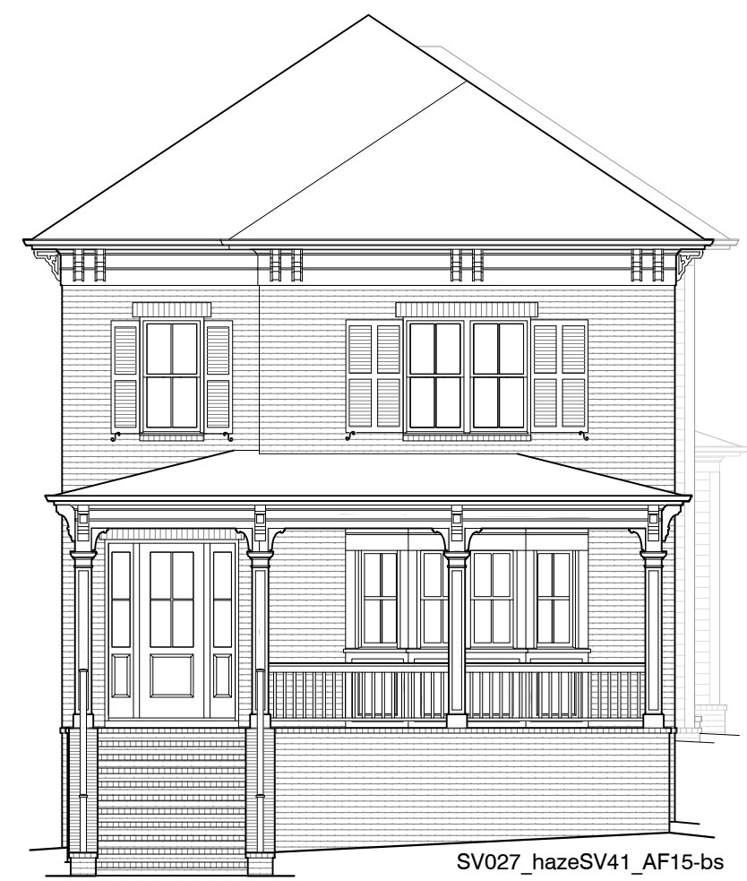
1 FRONT ELEVATION 1/8" = 1'-0"