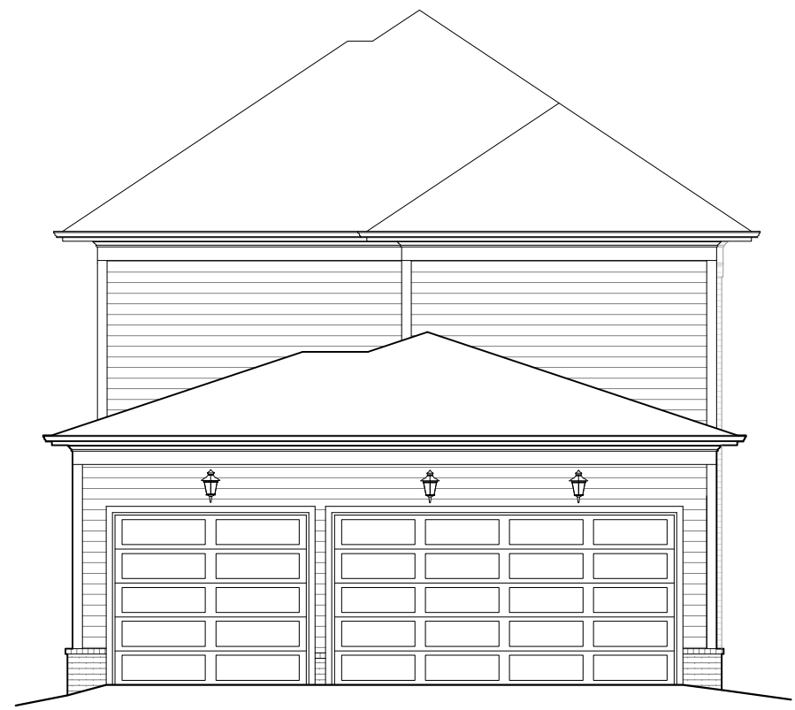
2 REAR ELEVATION 1/8" = 1'-0"